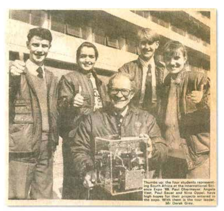
Above: 1989: The first South Africans from the Expo to participate in MILSET's ESI Right: South Africa's participation in ESI has been unbroken since 1989.